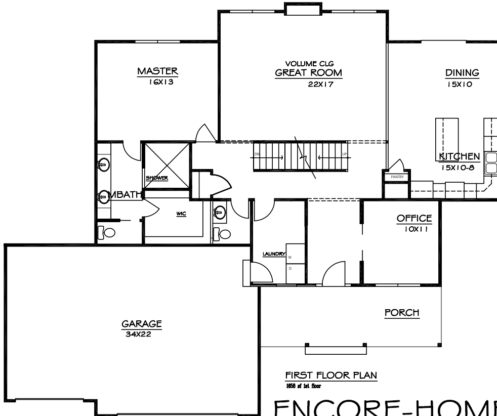
FIRST FLOOR PLAN 1656 of 1st floor